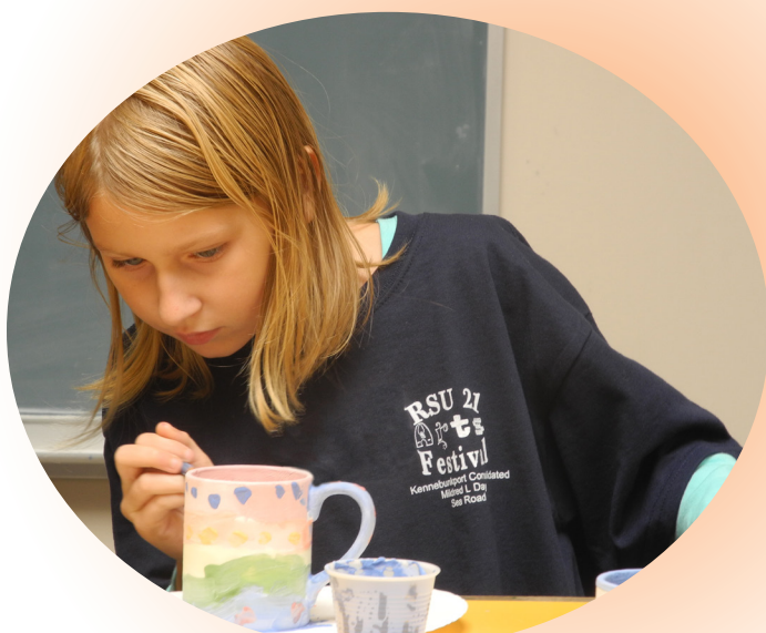
4TH AND 5TH GRADE ARTS FESTIVAL AT SEA ROAD SCHOOL

The Nonantum Resort, Kennebunkport Friday, May 13, 2016 7:00-10:30 p.m. Heavy hors d'oeuvre Cash bar Attire - Dressy Casual $30/person Live and Silent Auctions Raffles and Wine Wall Tickets and information: www.educationfoundationka.org or at Norway Savings Bank EFKA Education Foundation of the Kennebunks and Arundel Libby Queen Kingsley's Champion Norway Savings Bank COLORFUL SOLUTIONS™