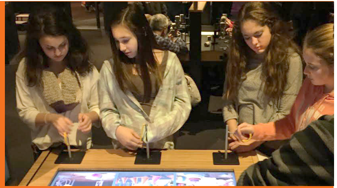
8TH GRADE FIELD TRIP TO BOSTON'S MUSEUM OF SCIENCE

PO Box 1531 Kennebunkport ME www.educationfoundation.org Like us on Facebook